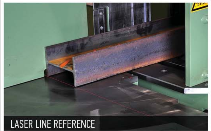
LASER LINE REFERENCE