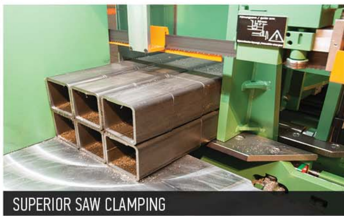
SUPERIOR SAW CLAMPING